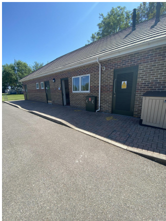
The dropped kerb to access the toilet block