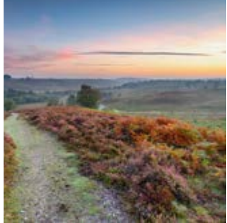
Sunrise over Rockford Common, New Forest

The New Forest has an extensive cycle way network, cycle routes start within 500 yards and the nearest National Cycle Network route to this site is route number 2, Southampton to Exeter.