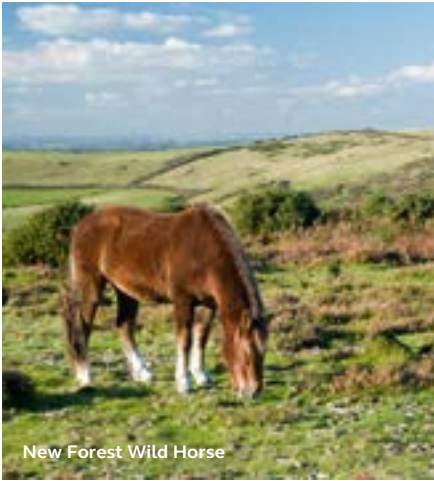
New Forest Wild Horse