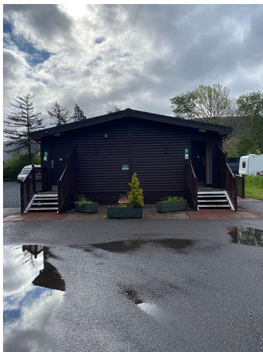
Entrance to Male and Female Facilities