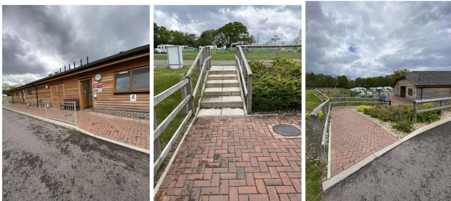
Dropped kerb, stairs and ramp to access the toilet block